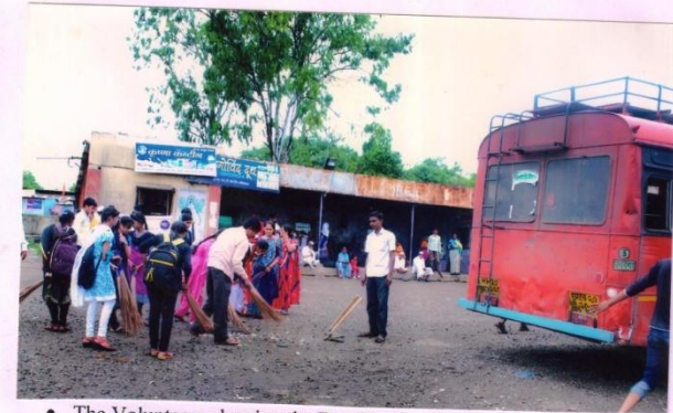
• The Volunteers cleaning the Bus Stand of Chousala.