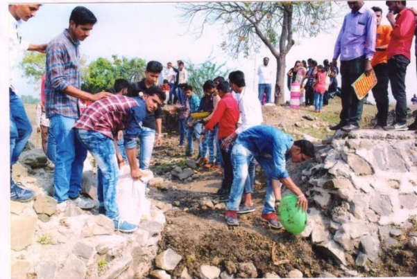
• First Photo of Small Water Reservoir