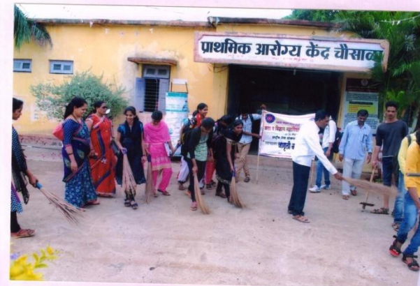
• The Volunteers Cleaning at PHC, Chousala.