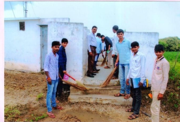
• The Volunteers Cleaning Toilets and Urinals.