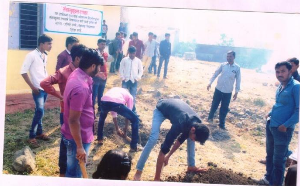
• Volunteers while Digging Bed and Planting Tree.