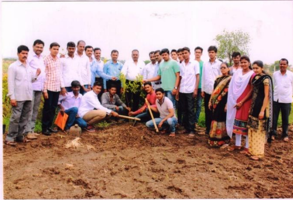
5. Global Population Day - 11 Jul 2017