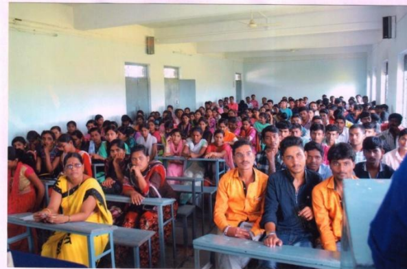
• Present Staff, Students and Volunteers.